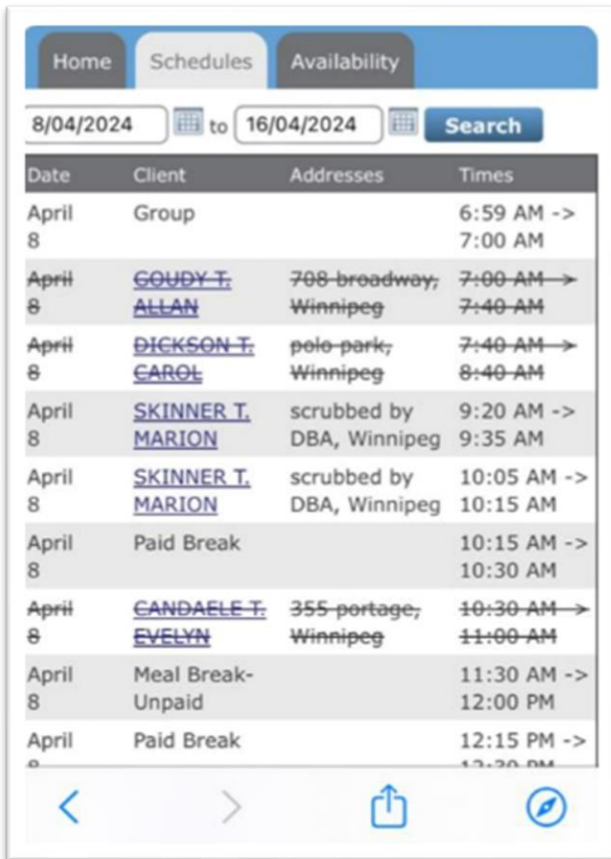
Figure 2 Schedule Tab

Availability Tab will show your availability for each area you work for. This tab is to view information only, you cannot enter information here.