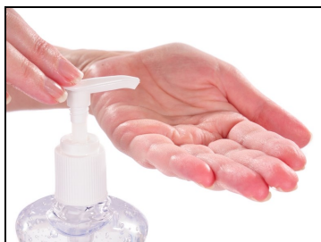
Alcohol-based hand rub (ABHR)

Proper technique is important when it comes to effective hand hygiene. Without proper hand hygiene technique, we can still spread many microorganisms with our hands. This section will cover the proper techniques for the following methods: