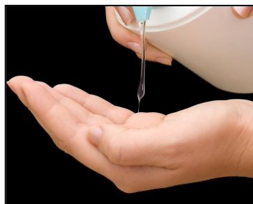
Without water when hands are visibly soiled