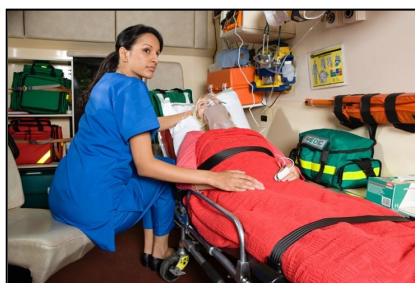
Care involving contact