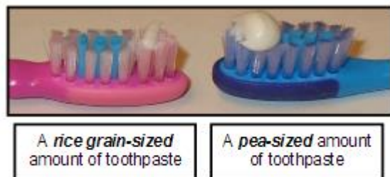
Figure 1. Recommended amount of toothpaste for children 0-3 years old at risk of tooth decay (rice grain-sized) and children 3-6 years old (pea-sized).