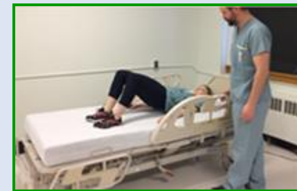
✓ Extremities Lower Body