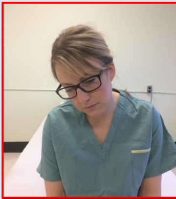
✗ Not Alert

ACES SCREEN: Perform ACES screen before assisting client to stand. Report any changes in the client's ability to do any of the following: *This is not to replace the initial intake assessment.