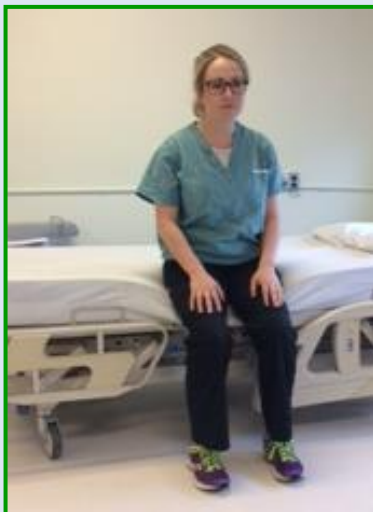
✓ Sits Unsupported