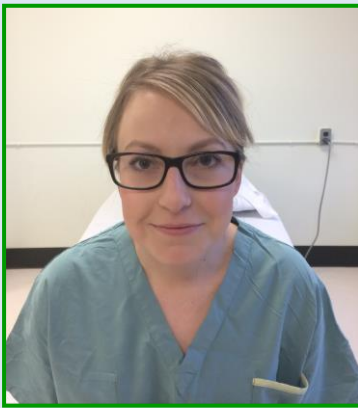
✓ Alert & Energetic