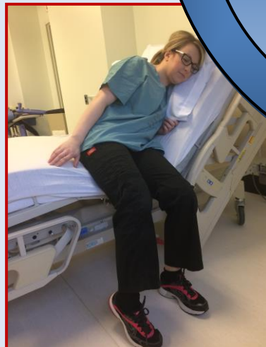
✗ Unable to Sit Unsupported